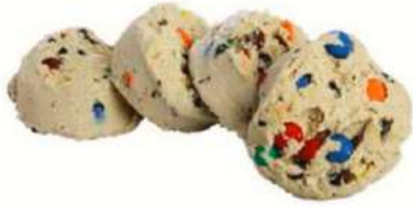
Unbaked cookie dough, as distributed

Food Name: Carnival Frozen Cookie Dough with Colored Candies and Chocolate Chips / Pâte à biscuits congelée carnaval avec bonbons colorés et pépites au chocolat Finished Foods: Carnival Frozen Cookie with Colored Candies and Chocolate Chips / Biscuit carnaval avec bonbons colorés et pépites au chocolat Brand / Customer: Otis Spunkmeyer Sub Brand: Sweet Discovery